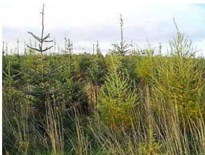
Mixed tree planting, spruce & larch

Possibly the easiest of mixtures to plant and manage, line mixtures consist of single species rows, traditionally of three and three in conifer and broadleaf mixes. This mix is almost entirely used for commercial timber production, but is now rare, as the 'pyjama strips' can be visually intrusive.