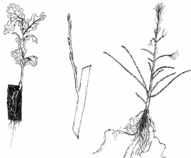
Cell grown plant Willow cutting Larch transplant

As a cutting is a clone, it is important to use a variety of parent plants to reduce the risk of disease. In practice, it is recommended that a variety of clones and species are used for anything other than small scale planting.