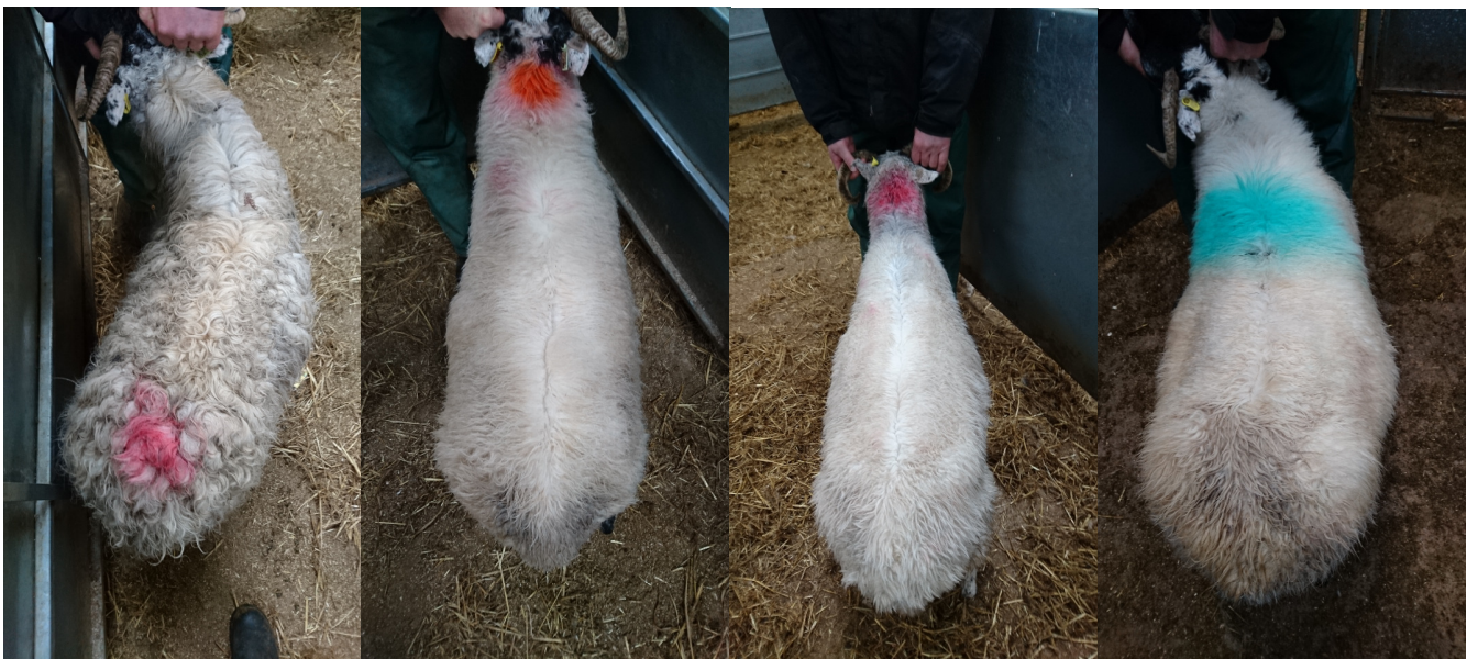
Condition Score 1.5 Condition Score 2.0 Condition Score 2.5 Condition Score 3.0

As the picture above demonstrates, it is difficult to condition score ewes by eye. These ewes have been condition scored at tupping time in November, with a full fleece. By eye the sheep at condition score 2.5 looks leaner than the sheep at 2.0, but the sheep at 2.0 has more fleece than the 2.5 sheep making her look in better condition.