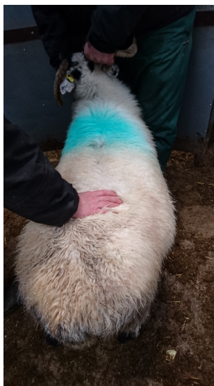
Picture 1 - Condition Scoring a Scottish Blackface Ewe

Condition scoring is a score of fat and muscle, between 1 and 5, where 1 is very lean and 5 is very fat. A guide of body condition scores 1-5 is shown below.