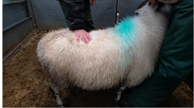
Picture 2 - Position of hand to condition score a sheep

See the Technical Note for descriptions and diagrams of how to assess each score. If you are unsure, ask your advisor or local vet to demonstrate condition scoring on your flock.