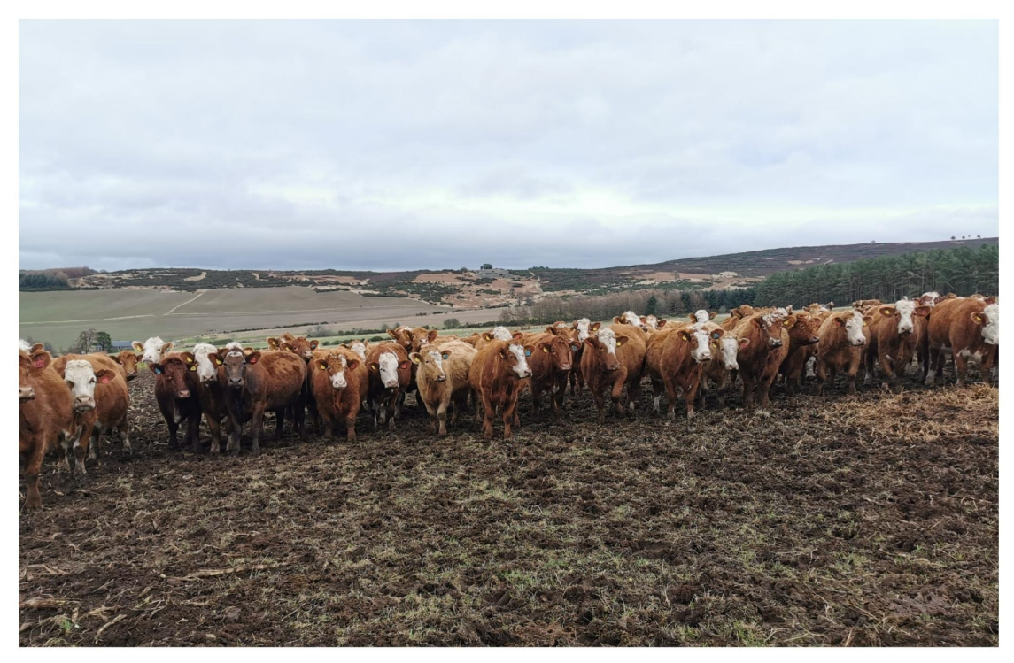
Discussing regenerative grazing at Strathmore Farming Company, Angus.