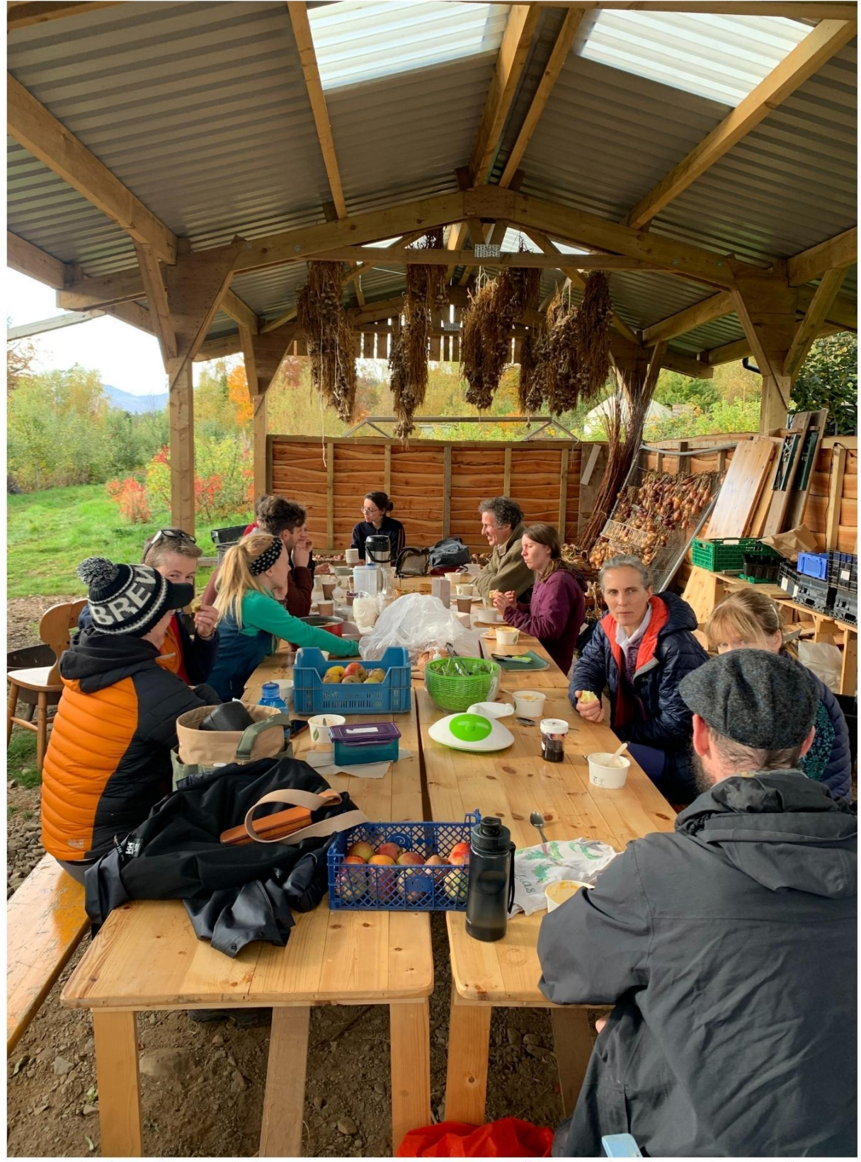
Local food making peer-to-peer knowledge transfer a treat: Tomnah'a farm. Market Gardening Group.