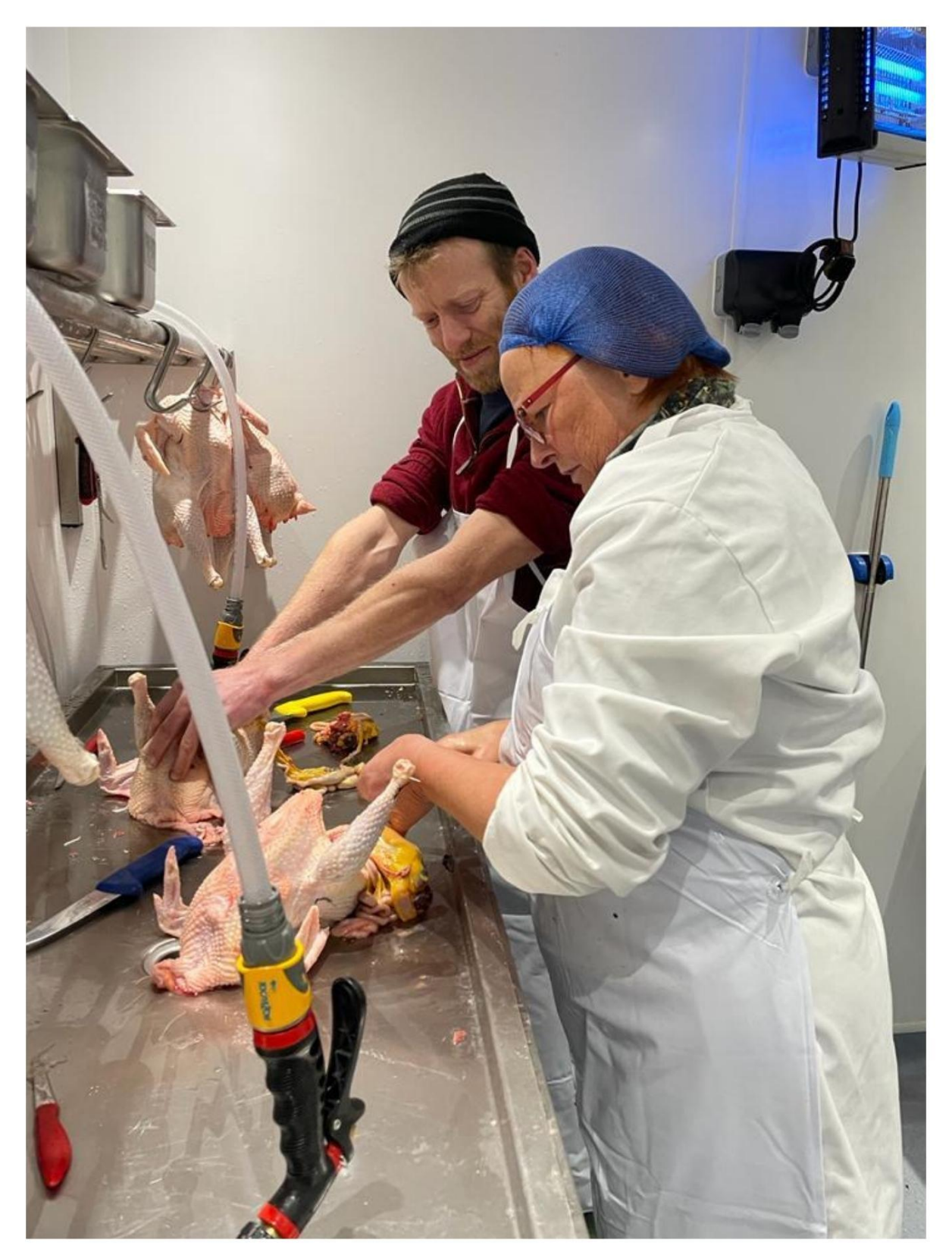
Chicken processing skillshare at The Sailean Project on the Isle of Lismore, Nov 2022