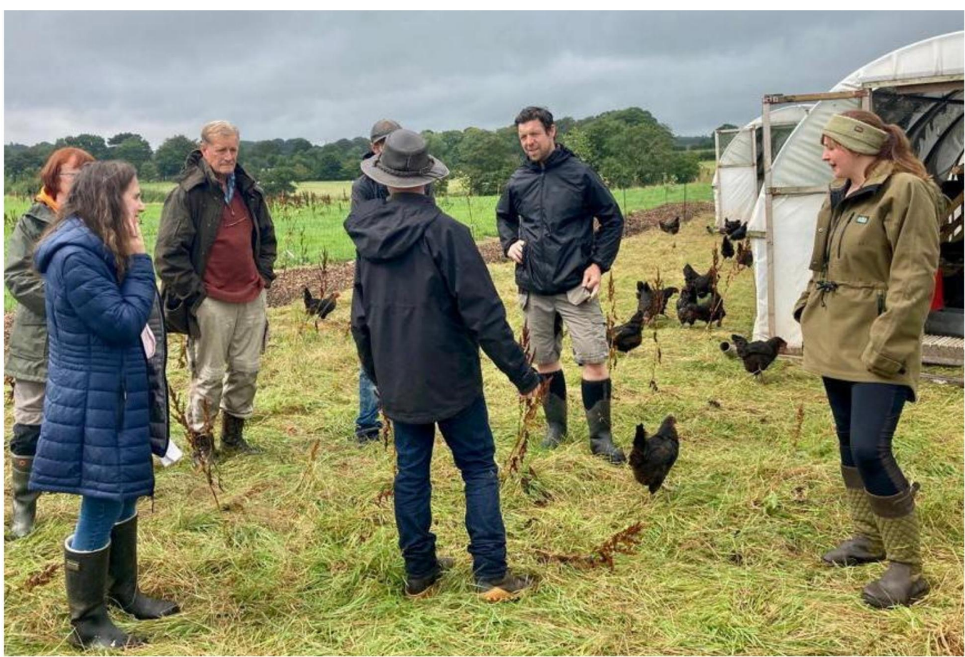
Pasture Poultry Feed Group visit to Ramstane Farm, North Ayrshire, Aug 2022