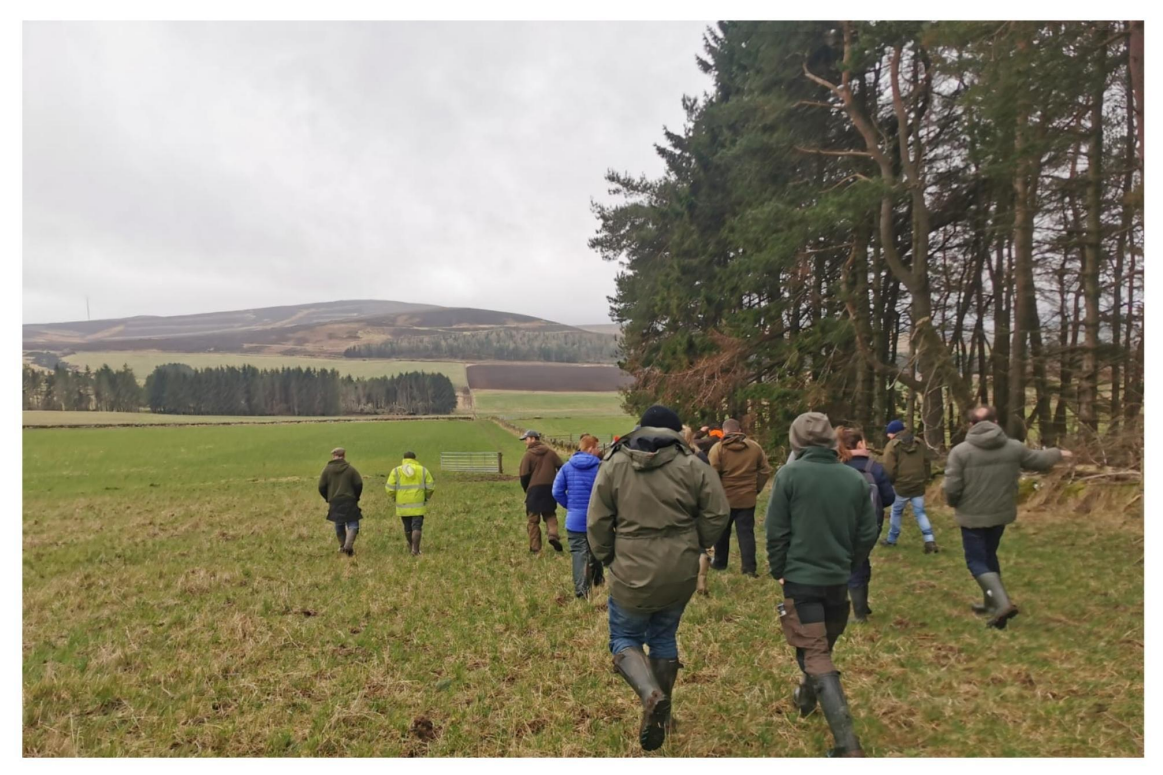
Walking next to shelter belts at Strathmore Farming Company, Angus.