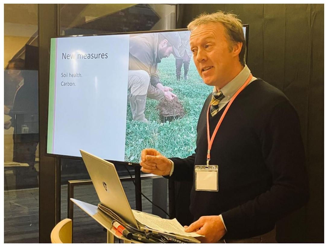
Biodiversity & Profitability Group presentation.