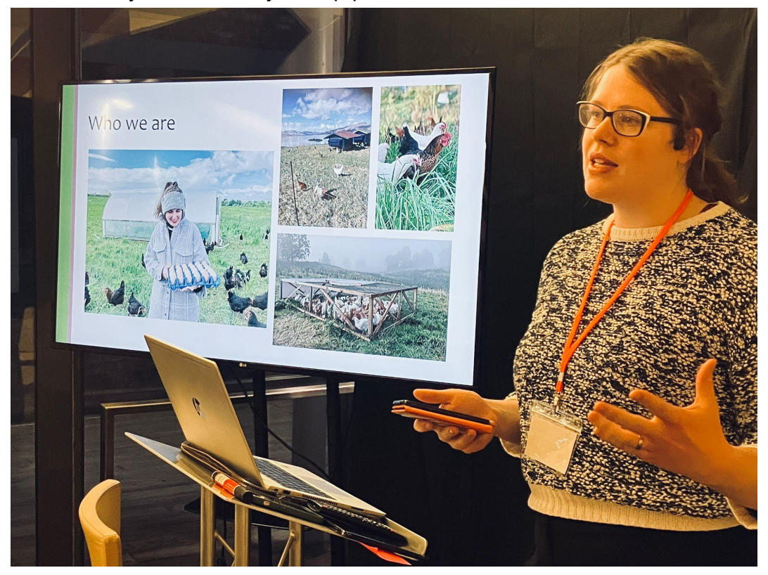
Pasture Poultry Group presentation.