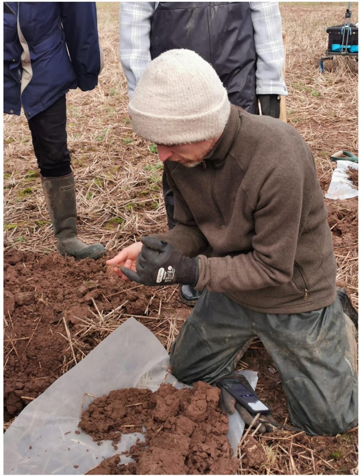
Counting worms and thinking about soil structure with the Biodiversity & Profitability Group.