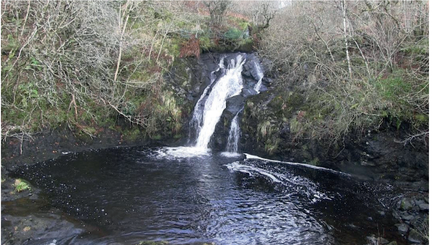
Figure 10. Waterfall on the Noddsdale Water.

The planting is also in an area popular with tourists and locals alike. Some of the planting is adjacent to an existing community woodland with associated car parking. It also links in with a core path along the Brisbane Glen Road. Pedestrian access has therefore been provided to many of the planting areas with footpaths being created through the newly planted woodland.