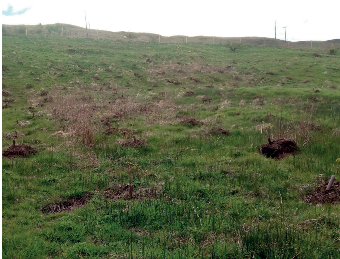
Figure 1 New planting extending up to the road above.