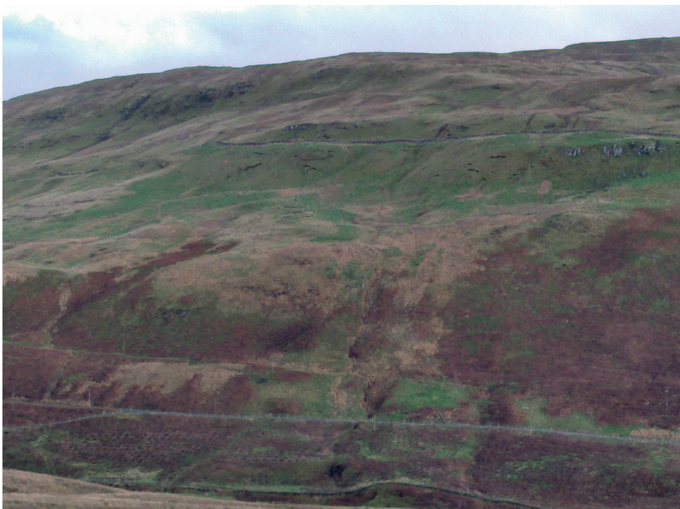
Figure 3 The future planting site at Coxy Hill, Brisbane Glen with previous year's native woodland planting below the road.

The majority of the land planted was under-utilised. Some areas were too steep to maintain properly, with gorse or bracken starting to dominate. In others, a combination of a fly problem, the steepness of the slope and the wetness of the ground in winter meant the area was very difficult to maintain in good a good condition for agriculture.