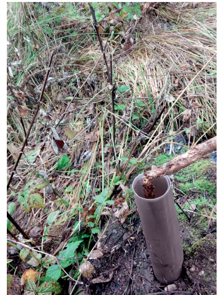
Figure 8. Vole damage to a young birch tree in the Brisbane Glen.

In addition to the water quality, natural flood management benefits and specific benefits to the farm, other important benefits are likely to be provided by the planting schemes. Most of the planting areas are within the Primary or Secondary zones of the Native Woodland Habitat Network. This means that the planting is extending or linking generally small, often isolated patches of existing native woodland. Making larger, contiguous areas of native woodland should provide significant benefits to biodiversity enhancement, allowing the native flora and fauna to spread into these areas. It will also help increase the resilience of these woodlands to future conditions such as climate change.