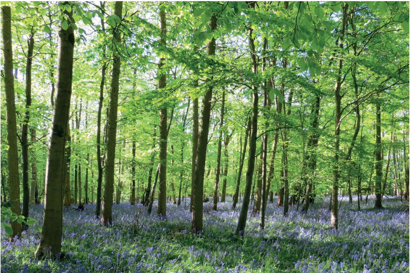
Figure 4. A diverse woodland with a mix of species, age classes and native flora.

To be most effective the woodland design should follow the landform, targeting water runoff pathways, particularly where temporary surface water collects and flows during heavy rain. Planting along the contours can intercept both water and pollutants draining from land further up the slope. Leaving an un-grazed grassy edge can also help with trapping sediment in runoff. This can all be achieved with careful planning and by integrating woodland planting with other farm activities.