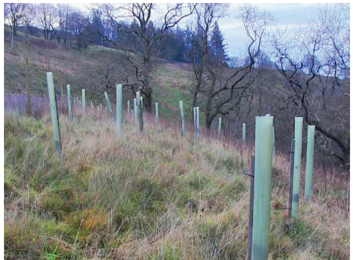
Figure 2 New planting extending existing native woodland by the Noddsdale Water.

Over a period of 4 years, more than 136ha of woodland creation will be carried out in the Brisbane Glen, by four separate landowners. Most of the new trees planted will be native broadleaves, with productive broadleaves planted where soil conditions, shelter and access made the area suitable for timber production. An area of pine forest has been planted where the soil conditions and access made this appropriate and to highlight landscape features.