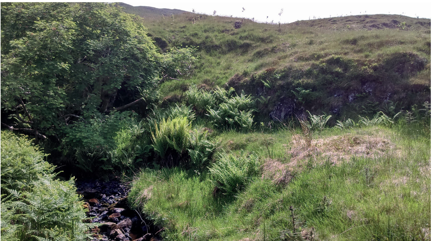
Figure 9 New planting extending a small fragment of native woodland along the Wittlieburn.