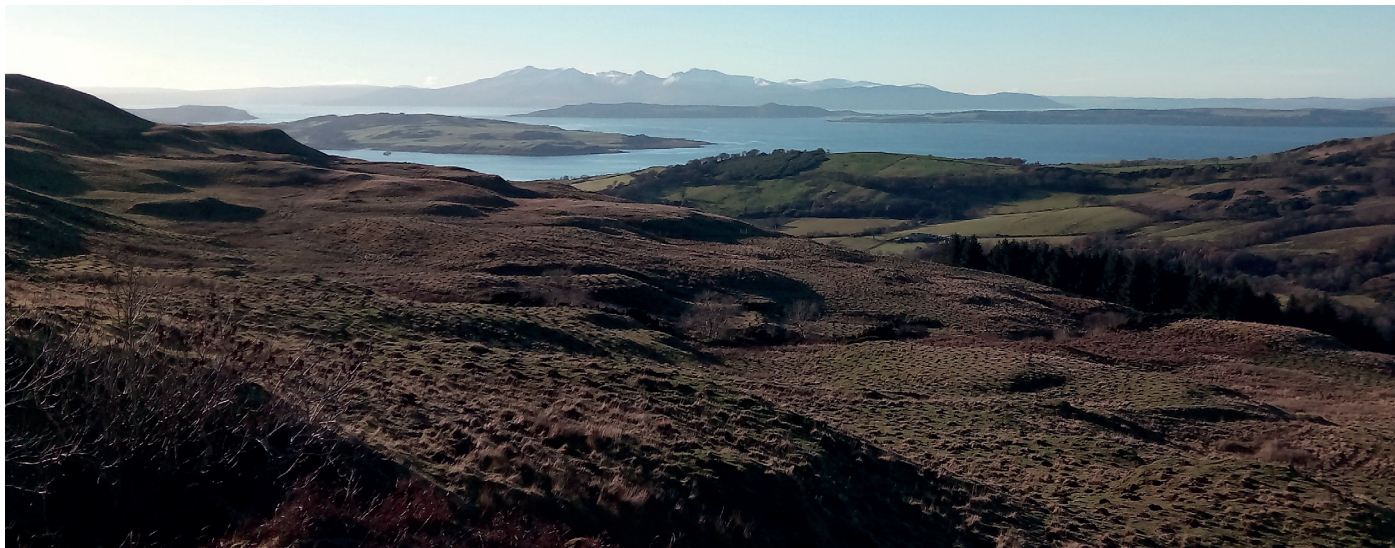
Figure 6 Planting along the Whittieburn at the southern end of the Noddsdale Water Catchment.

The local woodland strategy discourages commercial planting in the Brisbane Glen, mainly for access and landscape reasons and encourages planting types of woodland that will provide multiple benefits.